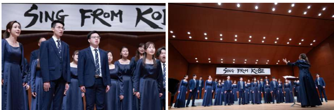
Photo 4, 5, 6: The SKH Lam Woo Memorial Secondary School Alumni Choir is also the winner of the Adult Choir category at the "Sing from Kobe 2026" International Choir Competition, earning the gold medal with the highest score of the event at 26.23 points.