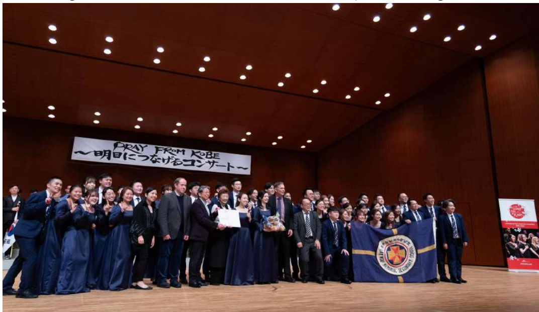
Photo 1, 2, 3: The SKH Lam Woo Memorial Secondary School Alumni Choir clinches the Grand Prize at the "Sing from Kobe 2026" International Choir Competition, receiving the event's highest honour, the "Kobe Choir Prize".